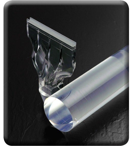
Transmittance of 2.54 cm thick Acrylic -

Both are available in cast sheets and rods having size tolerances typical of the commercial acrylic products.