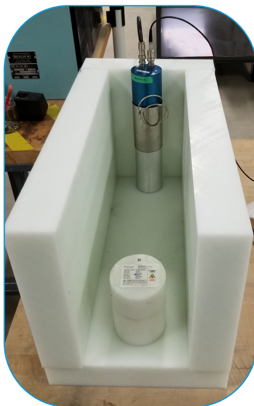
Figure 1. Photograph of a NaI detector in the test fixture with the neutron source in the foreground.

The PSD parameter is "Tail to Total Ratio", that is the amount of charge from the PMT in the Tail of the pulse as a fraction of the Total charge. Two integration windows are established. The first window (W1) is 0 to 600ns. The second window (W2) is from 0 to 1500ns. Thus Total=W2 and Tail=W2-W1 , and the Tail to Total PSD is, PSD=(W2-W1)/W2 .